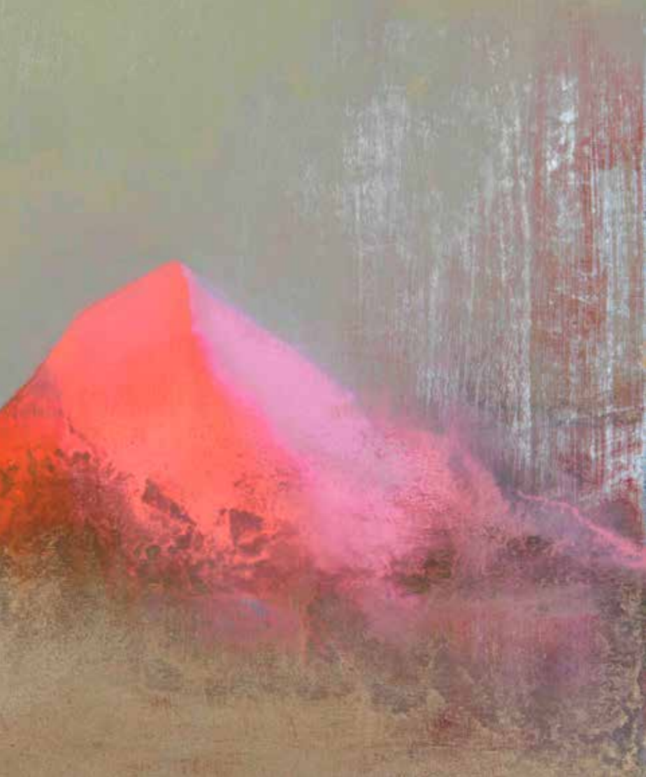
Guide oil & plaster on board 27 x 22 cm