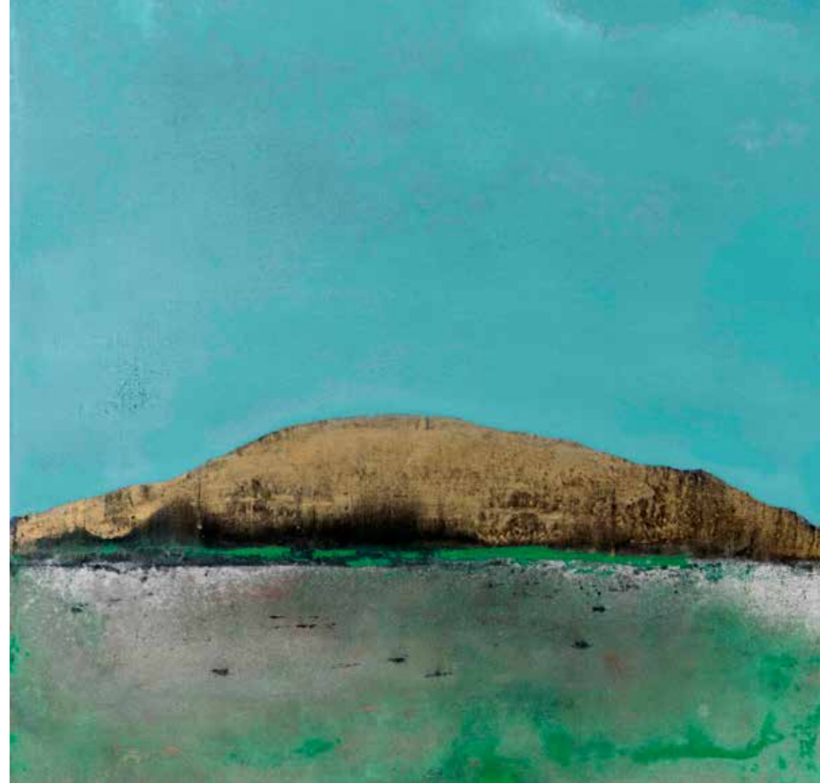
Gateway oil & plaster on canvas 60 x 60 cm