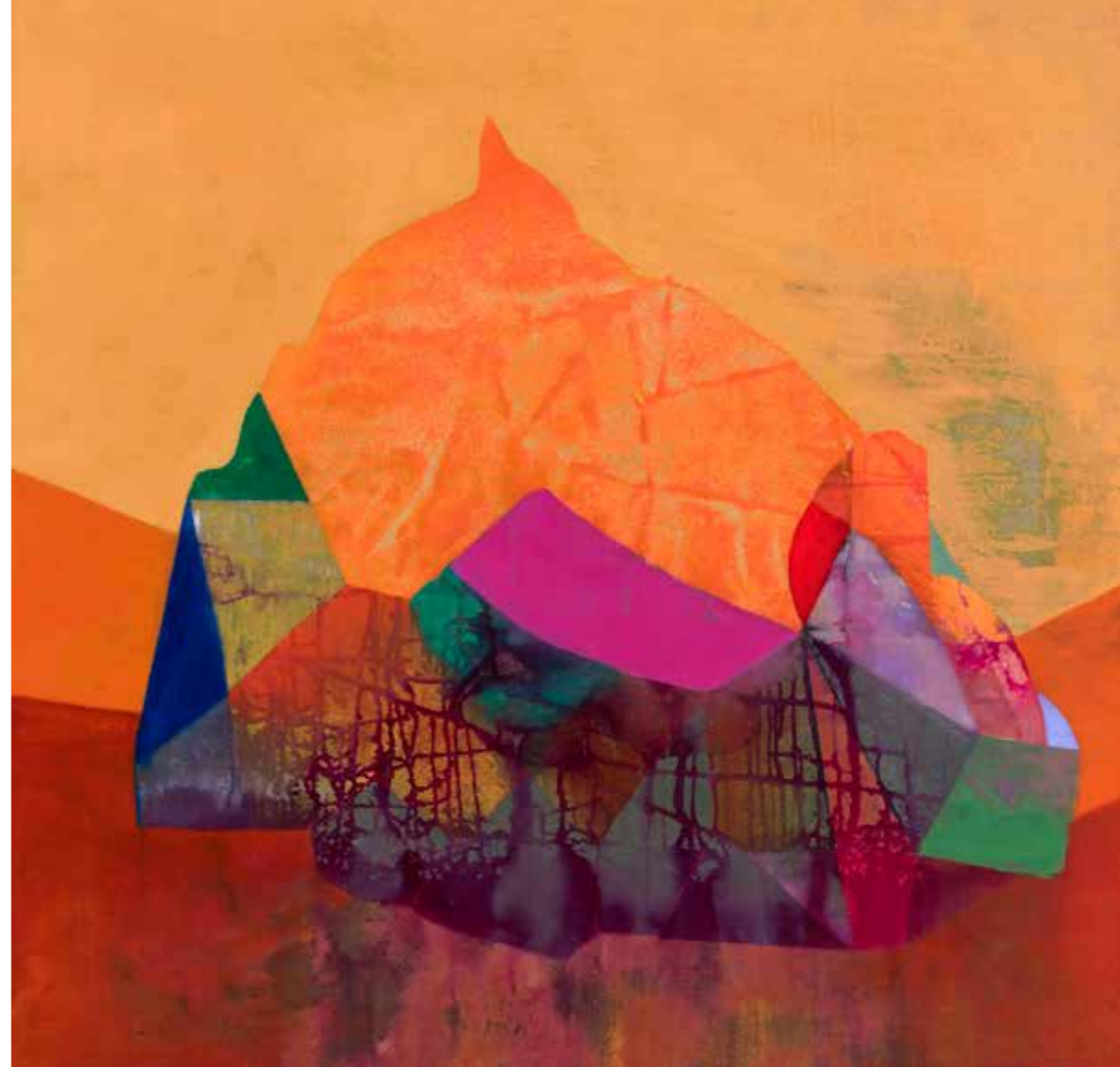
Filament oil, plaster & sand on canvas 30 x 30 cm