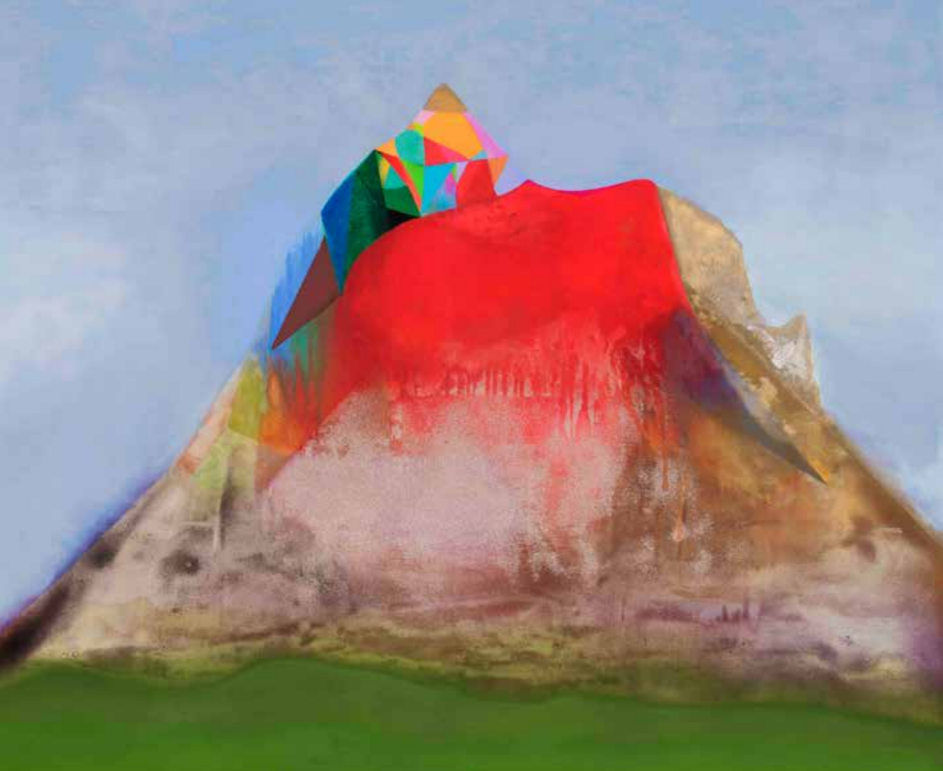
Left: Crown oil, plaster & sand on canvas 183 x 213 cm