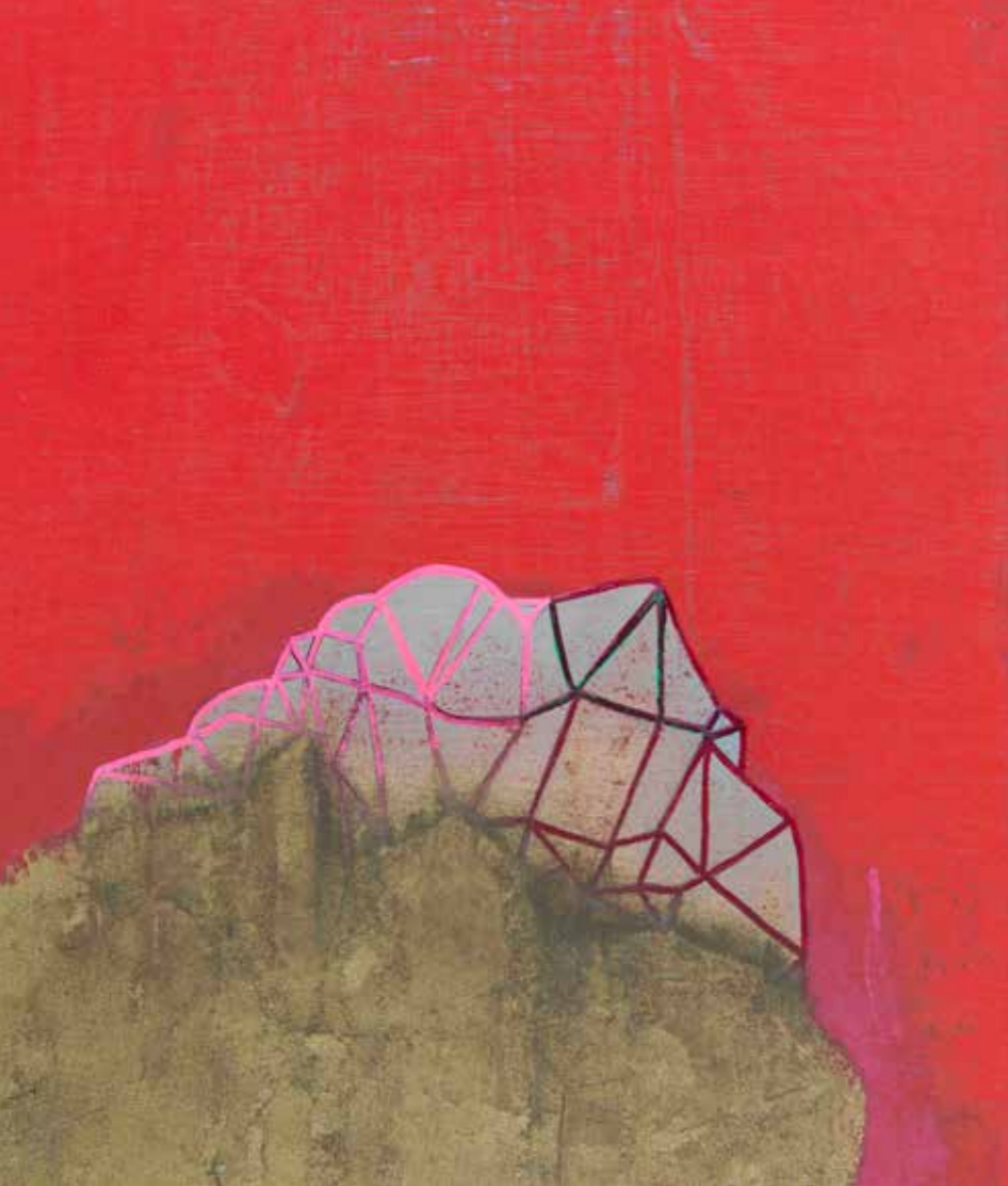
Towards the Sun oil & plaster on board 32 x 27 cm