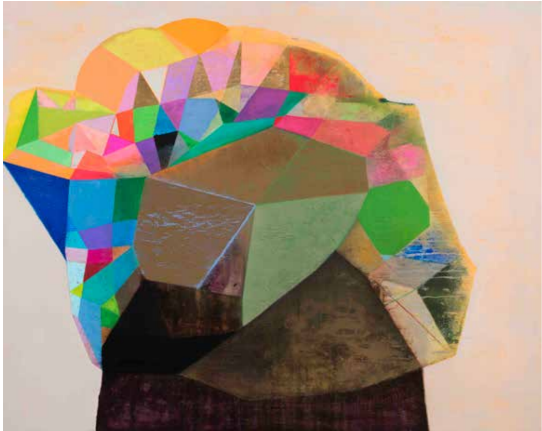
Left: Meristem oil, plaster & sand on canvas 122 x 152 cm