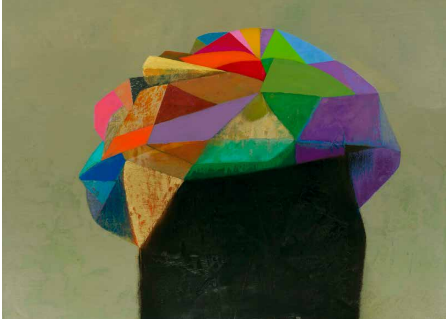
Right: Bloom oil & plaster on board 46 x 60 cm