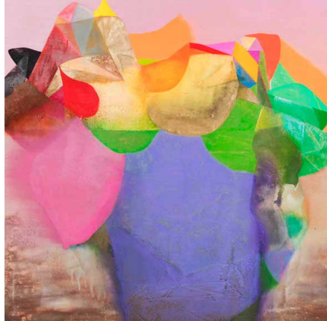
Germinate oil, plaster & sand on canvas 153 x 153 cm