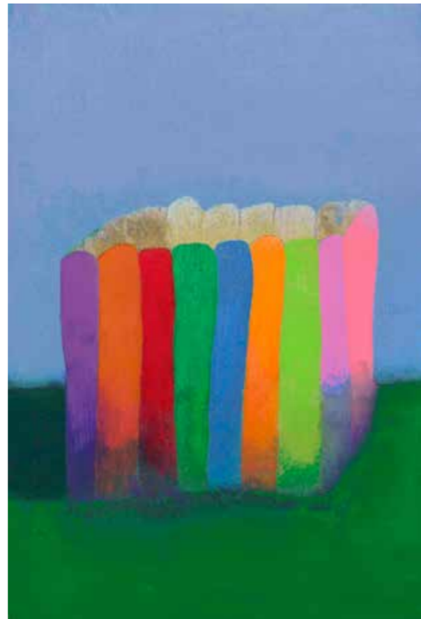
Elixir oil & plaster on board 24 x 16 cm

Collections The Central Bank National Concert Hall National Treasury Management Agency University College Cork University College Dublin University of Limerick The American Embassy, Dublin Investec AIB Bank Office of Public Works Cork Opera House Cork City Council National Self-Portrait Collection Cork Institute of Technology Smurfit Business School NCB Stockbrokers Deloitte Allianz Ibec Waterford Healing Trust Druids Glen Hotel & Golf Resort