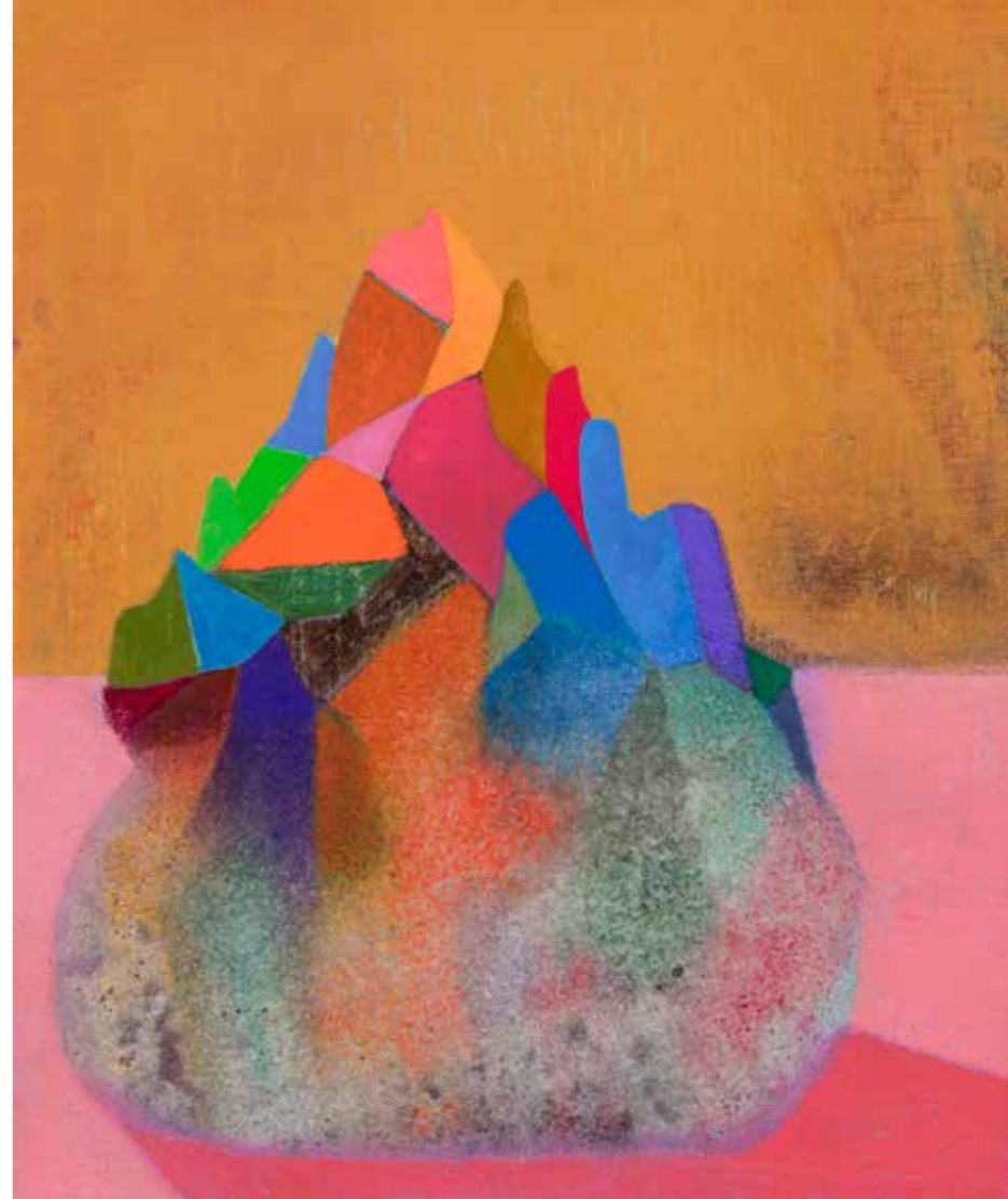
Right: Fountainhead oil, plaster & sand on board 27 x 22 cm