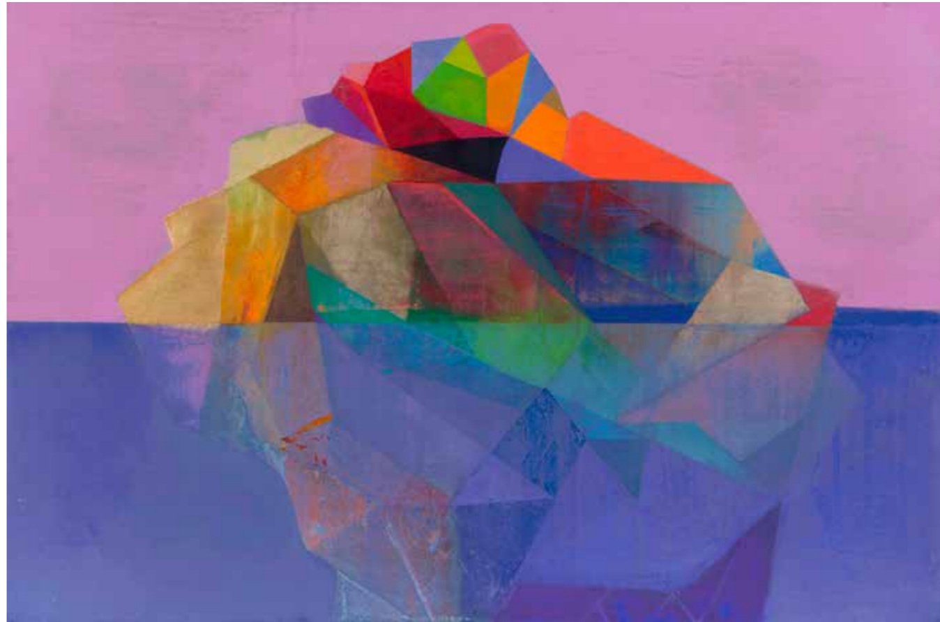
Right: Shores of Light oil & plaster on board 61 x 91 cm