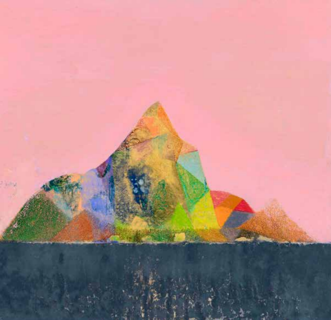
Aurelia oil, plaster & sand on canvas 30 x 30 cm