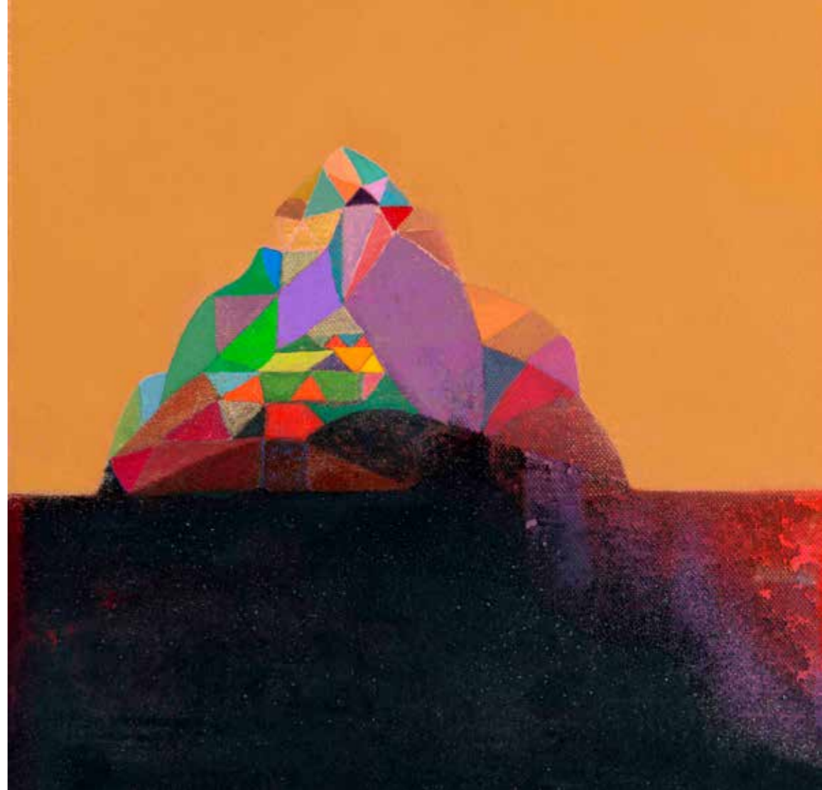
Conductor oil & sand on canvas 30 x 30 cm