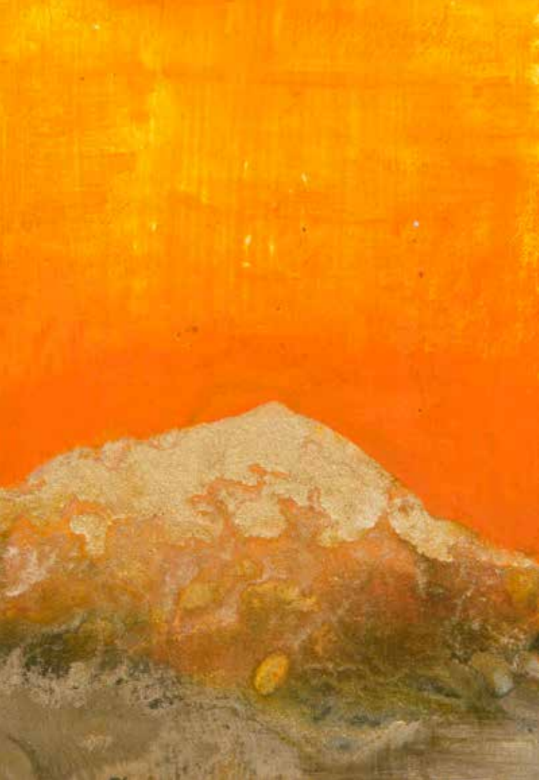
Sundew oil & plaster on board 24 x 17 cm