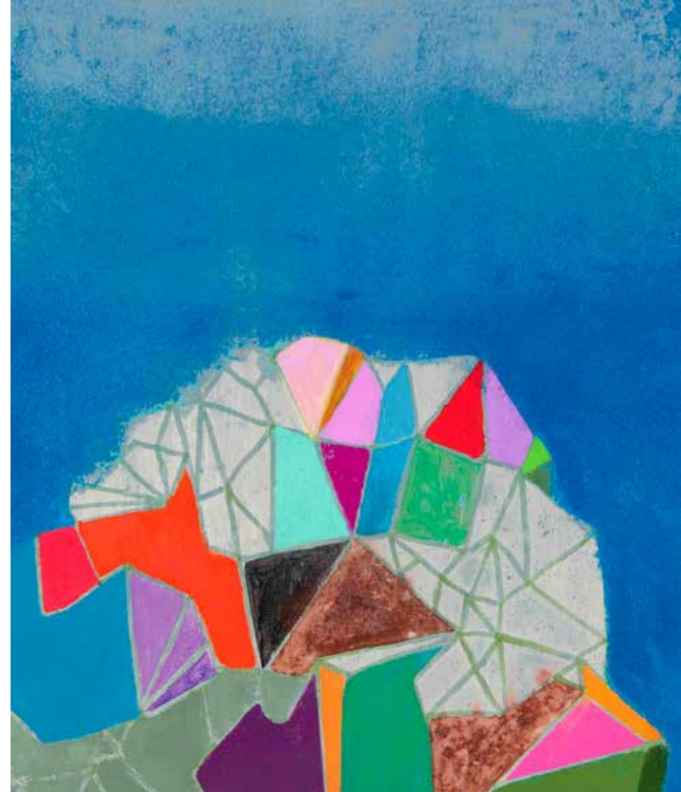
Near Field oil, plaster & sand on board 27 x 22 cm