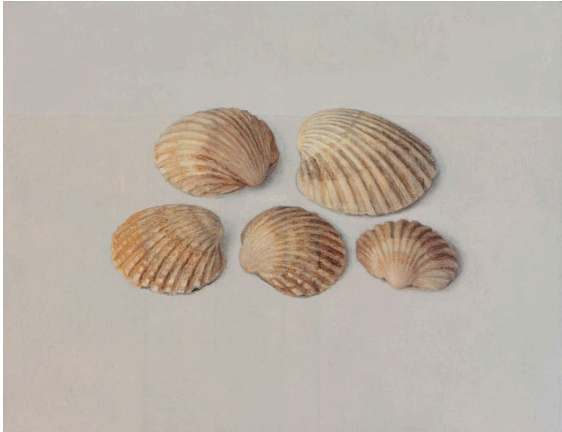
Left: FIVE SHELLS, PORTMARNOCK 2022 oil on board 13 x 16 cm