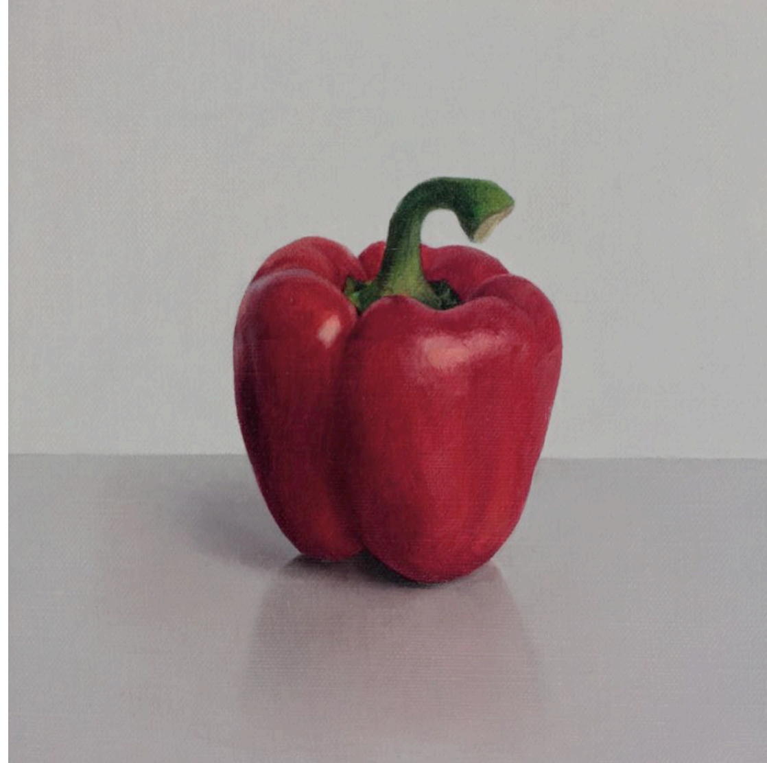
Right: RED PEPPER 2022 oil on canvas 21 x 20 cm