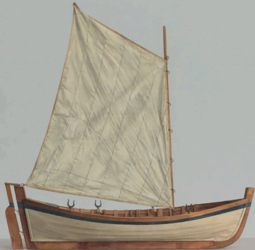
Right: MODEL SAILBOAT 2022 oil on canvas 90 x 98 cm