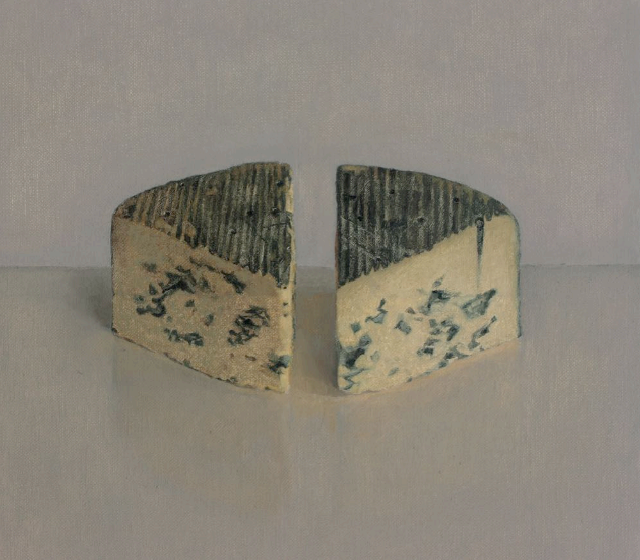
Left: CHEESE (CASHEL BLUE) 2022 oil on canvas 21 x 23 cm