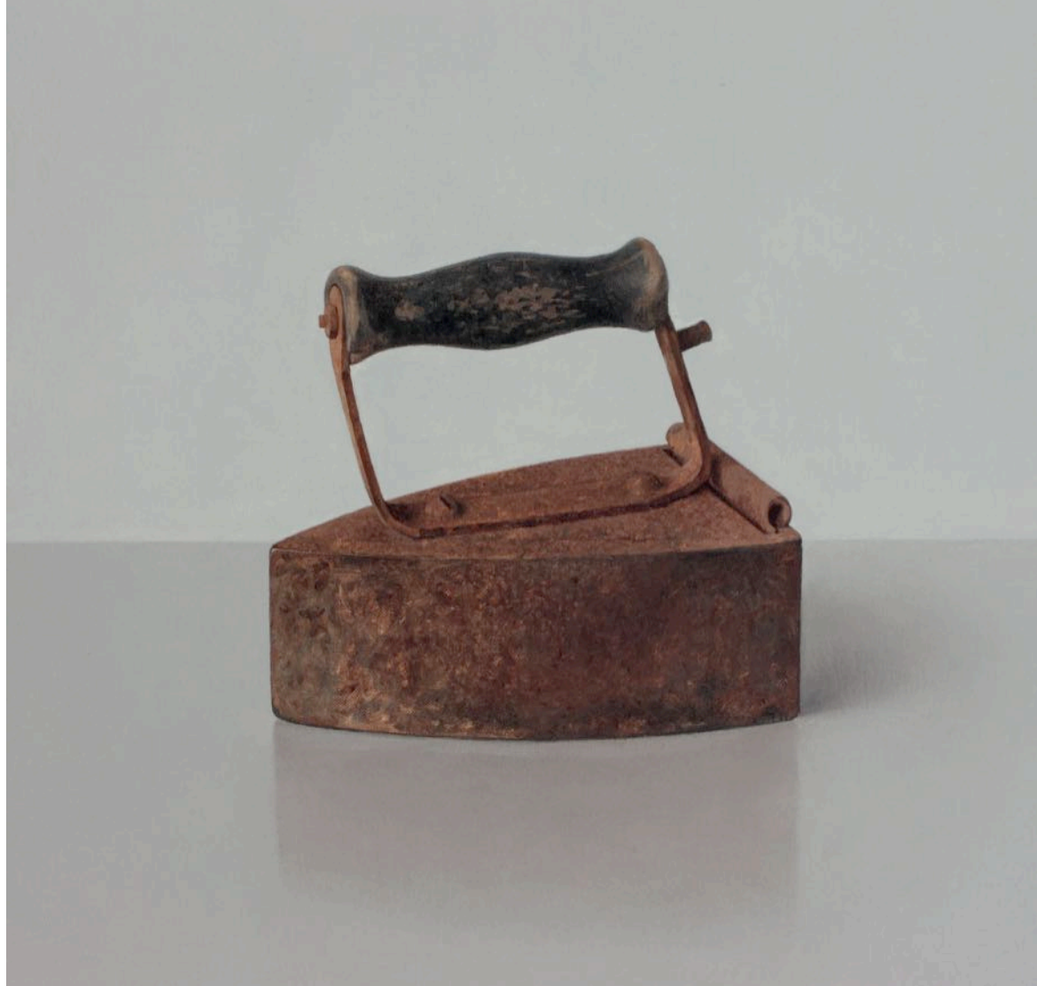
Right: IRON 2022 oil on canvas 33 x 33 cm