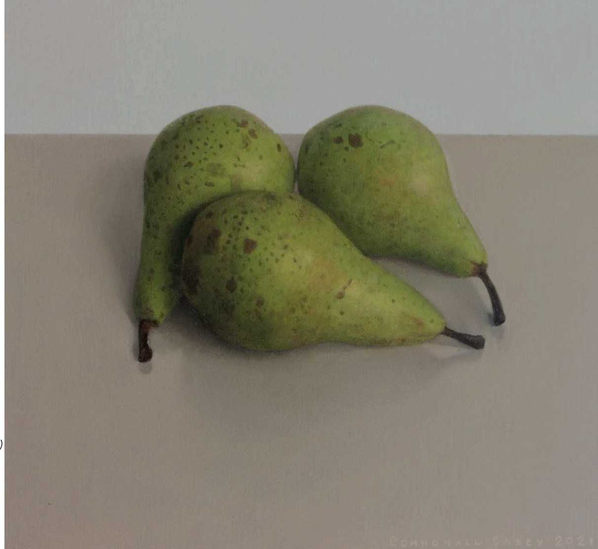
Right: THREE PEARS (CEPUNA) 2021 oil on canvas 23 x 24 cm