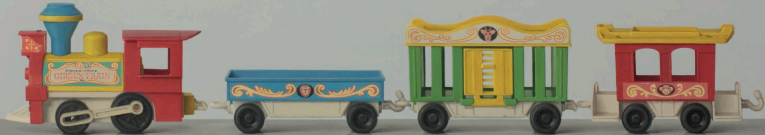
TOY TRAIN (FISHER PRICE CIRCUS TRAIN) 2022 oil on canvas 40 x 107 cm