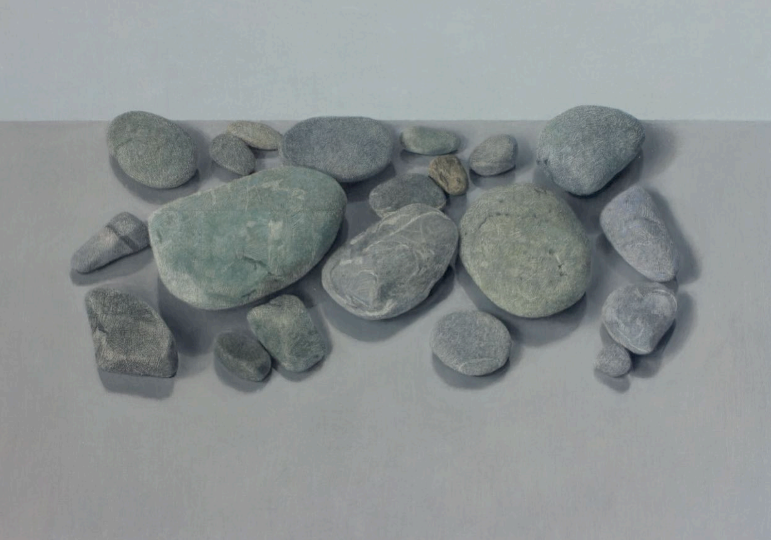
Left: TWENTY STONES, ARDGILLEN BEACH 2022 oil on canvas 27 x 36 cm