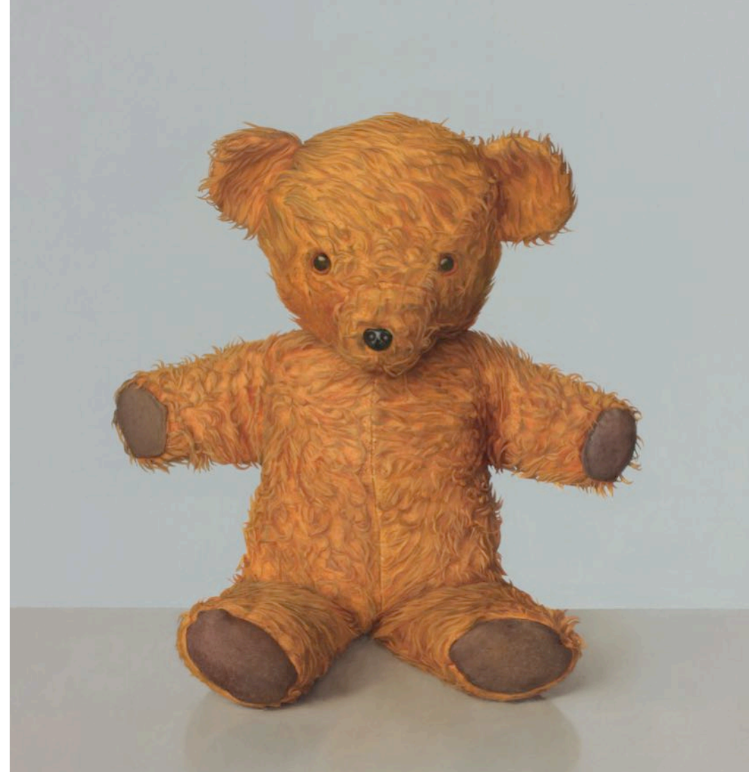
Right: TOY BEAR 2022 oil on canvas 55 x 50 cm