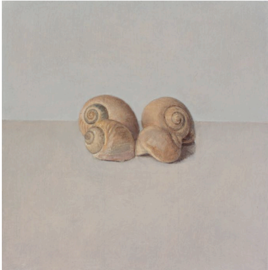
Left: FOUR SHELLS (PORTMARNOCK) 2022 oil on aluminum 13 x 13 cm