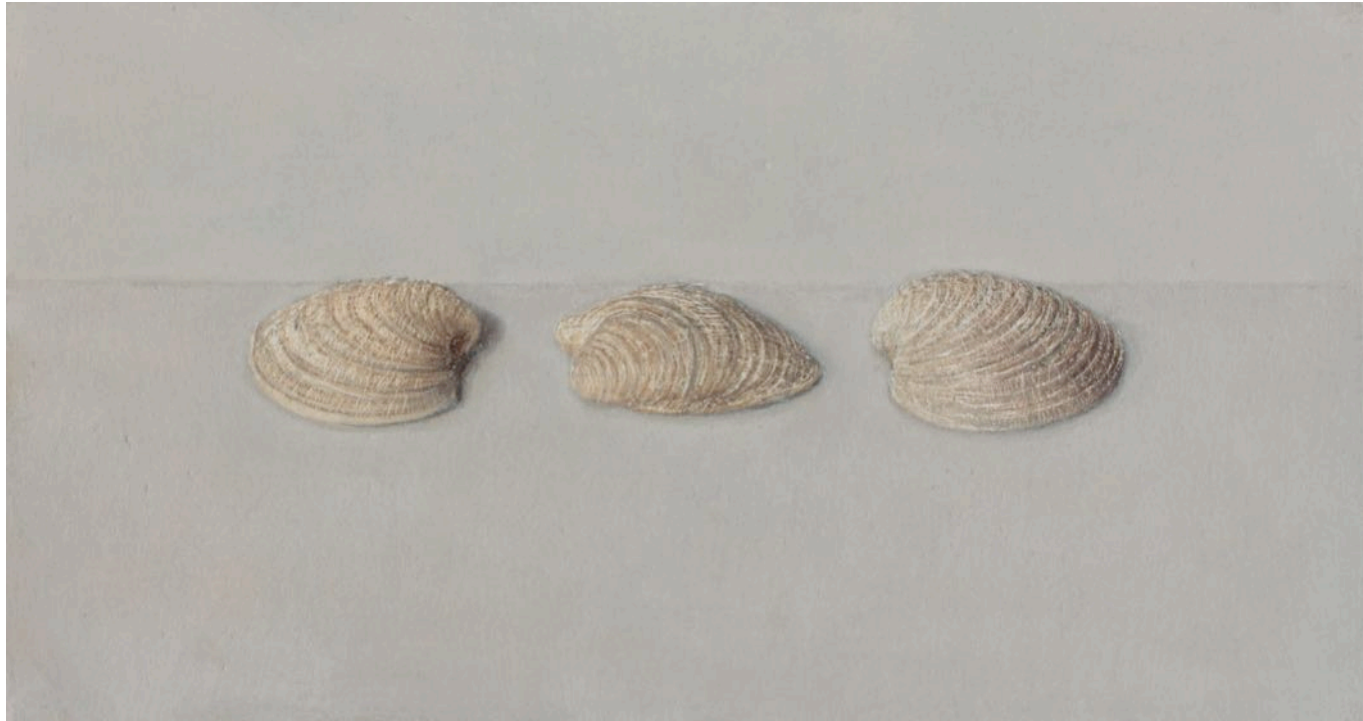
Above: THREE SHELLS (PORTMARNOCK) 2022 oil on board 8 x 14 cm