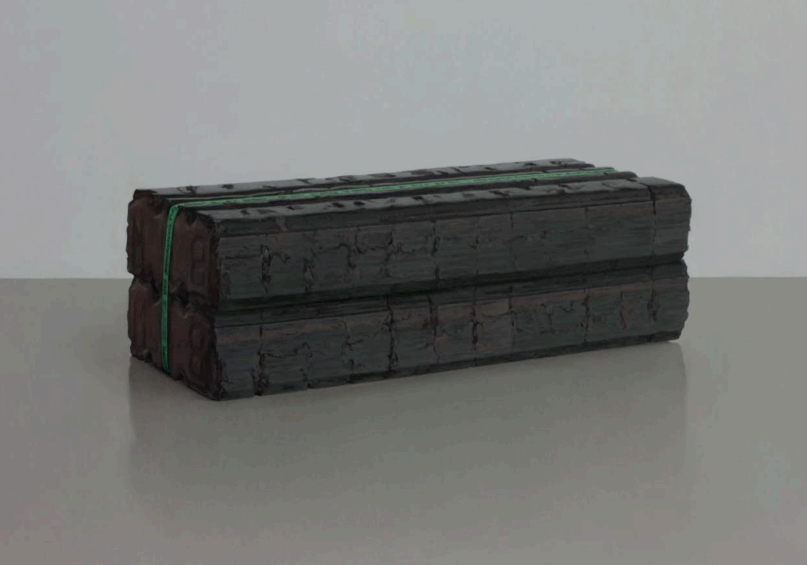
Right: PEAT BRIQUETTES (BORD NA MÓNA) 2022 oil on canvas 45 x 66 cm