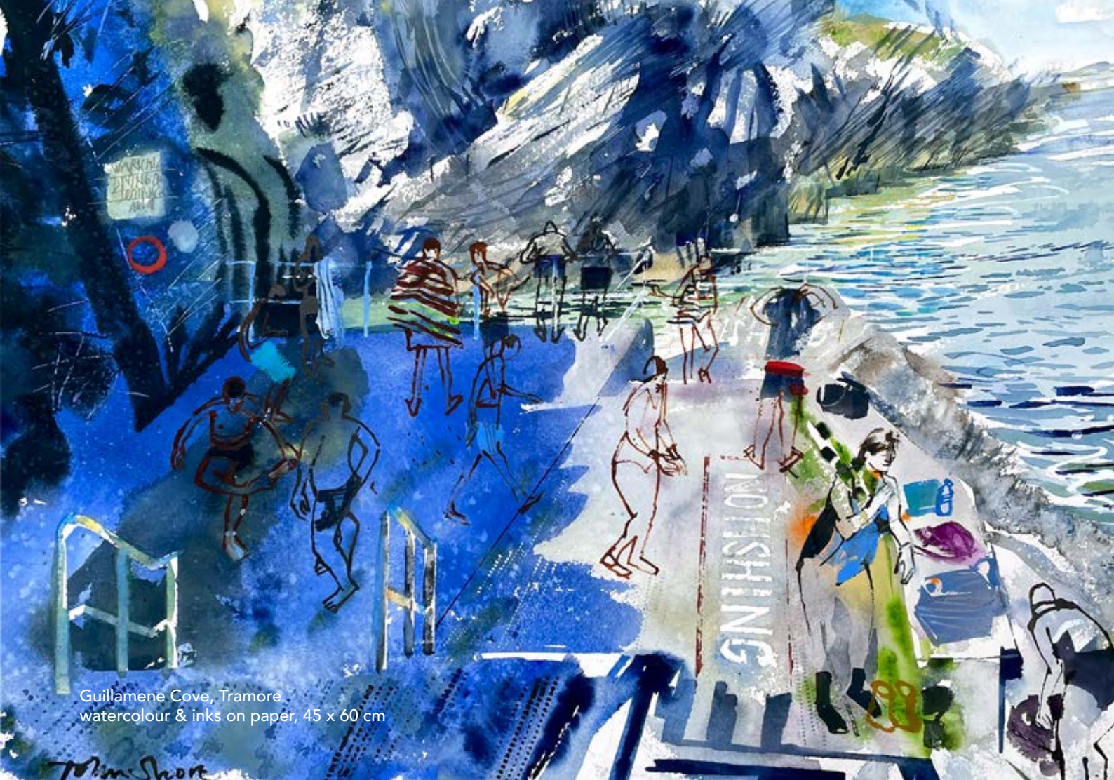
Guillamene Cove, Tramore watercolour & inks on paper, 45 x 60 cm