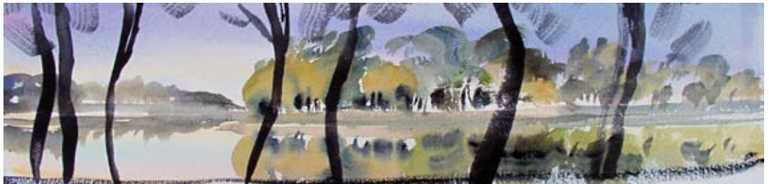
Murray River, Mildura, VIC, Australia, watercolour on paper, 13 x 51 cm