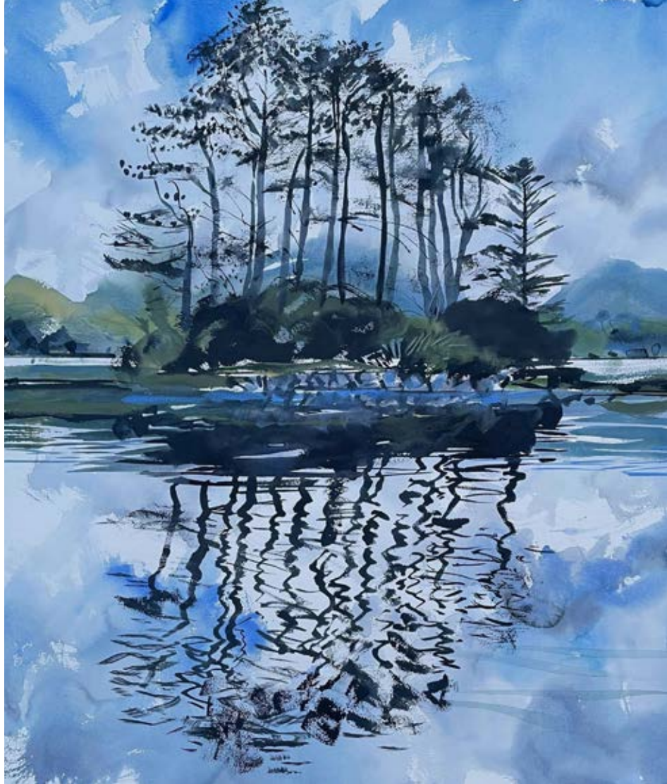
Wooded Island, Derreen Gardens, Co. Kerry watercolour & inks on paper 100 x 88 cm