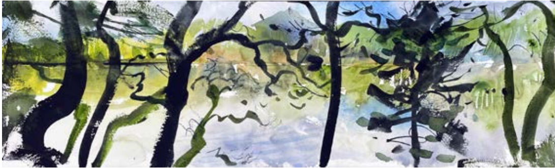
Inlet 1, Derreen Gardens, Co. Kerry, watercolour on paper, 26 x 91 cm