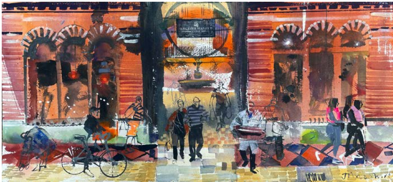
The English Market Entrance, Cork watercolour, inks & transfers on paper 35 x 76 cm