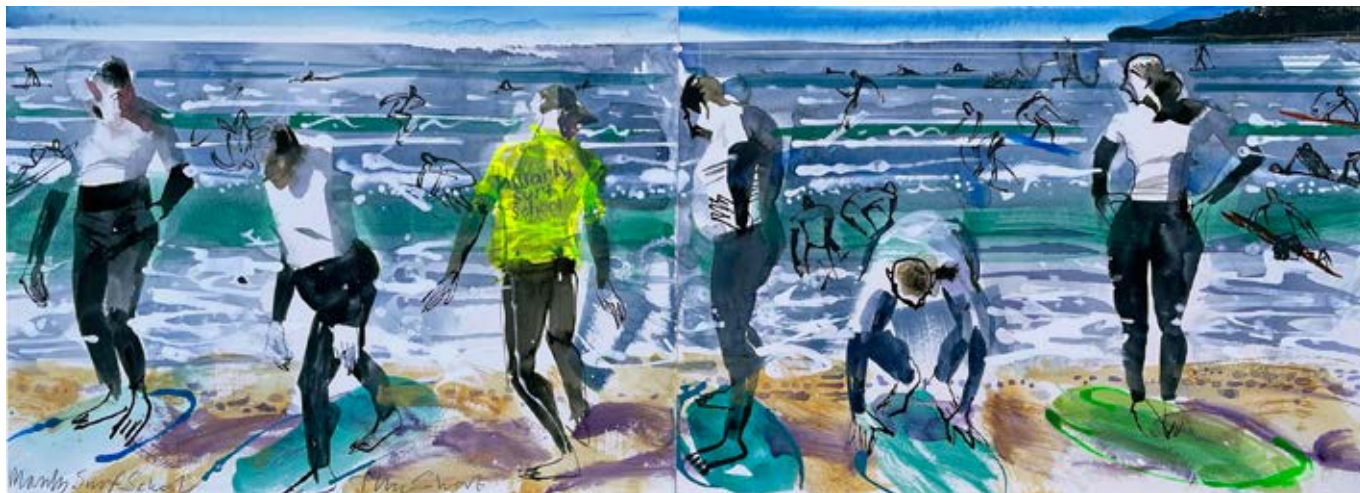
Manly Surf School, Australia watercolour & inks from sketchbook 29 x 82 cm