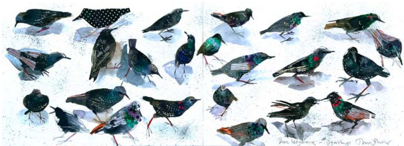
Starlings studies, watercolour, inks & collage from sketchbook, 29 x 82 cm