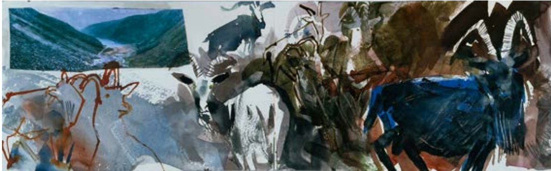
Goats, Glendalough, Co. Wicklow, watercolour, collage & inks from sketchbook, 13 x 41 cm