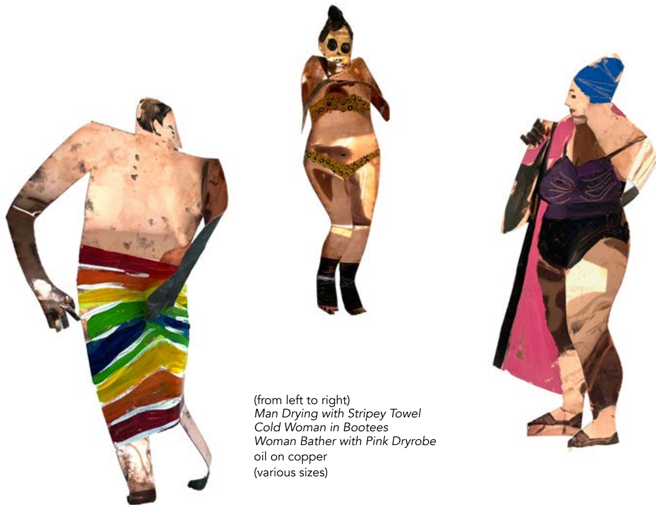
(from left to right) Man Drying with Stripecy Towel Cold Woman in Bootees Woman Bather with Pink Dryrobe oil on copper (various sizes)