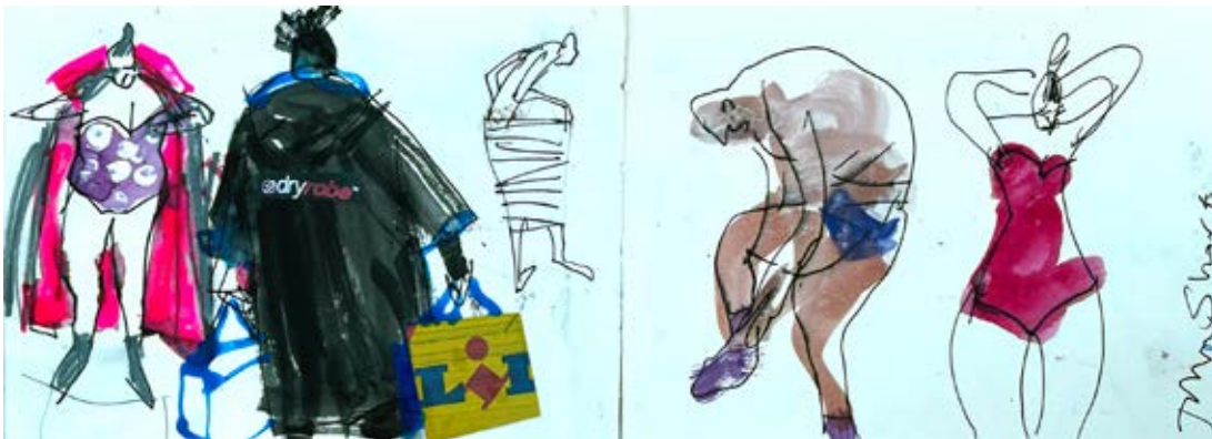
Lidl Bather, watercolour, collage & inks from sketchbook, 13 x 41 cm