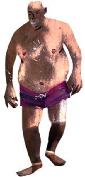
White Beard Walking Man

Various private collections in Europe, Panama, Singapore and USA