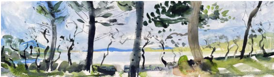
Inlet 2, Derreen Gardens, Co. Kerry, watercolour on paper, 26 x 91 cm