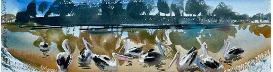
Pelicans on Darling River, Bourke, NSW, Australia, watercolour on paper, 14 x 48 cm