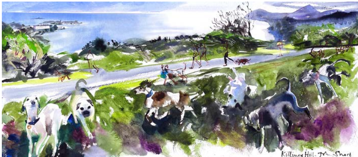
Dogs on Killiney Hill, Dublin watercolour & inks on paper 44 x 100 cm