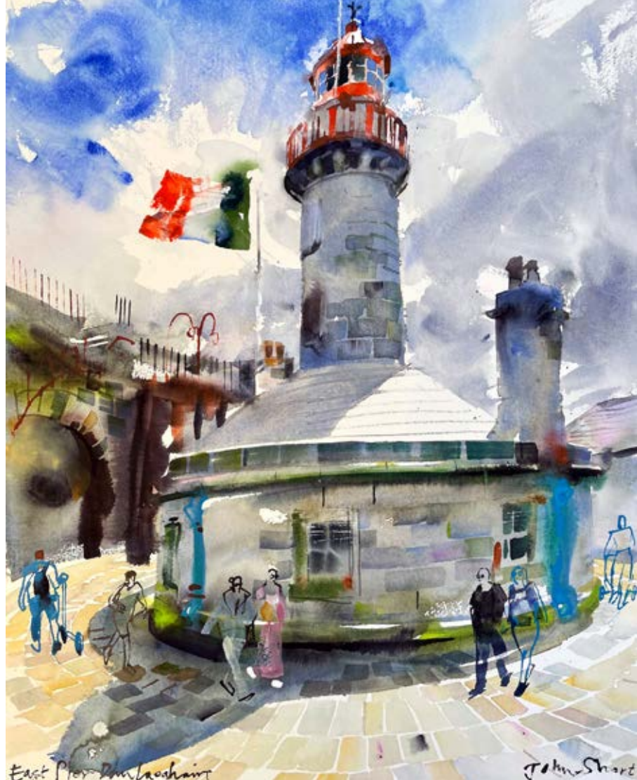
East Pier Lighthouse, Dun Laoghaire watercolour & inks on paper 63 x 51 cm