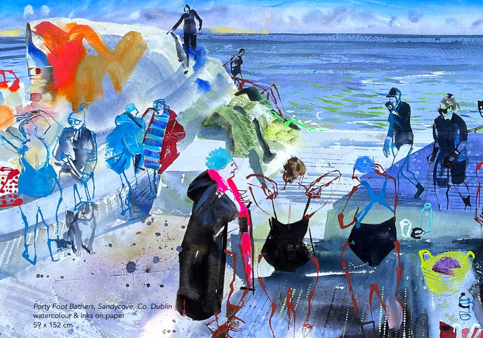
Forty Foot Bathers, Sandycove, Co. Dublin watercolour & inks on paper 59 x 152 cm