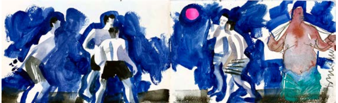
Keepie Uppie , watercolour & inks from sketchbook, 13 x 41 cm