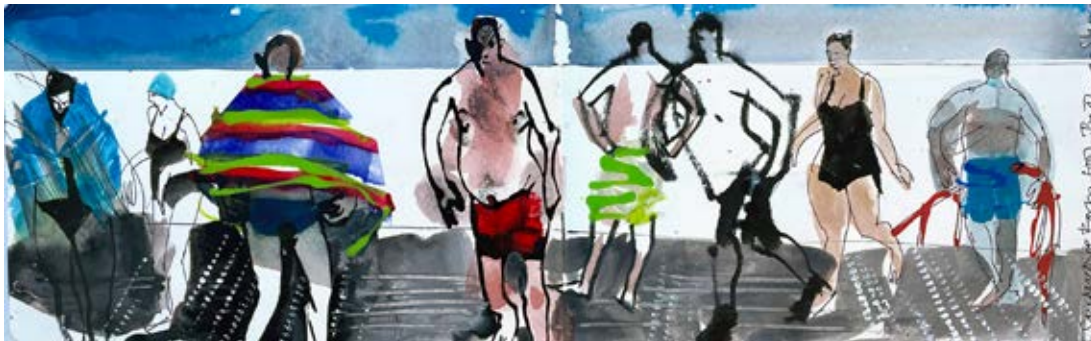
Stripey Towel, watercolour & inks from sketchbook, 13 x 41 cm