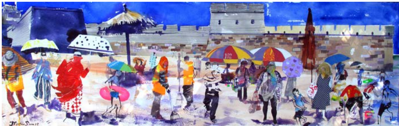
Where The Great Wall Ends on the Beach, China watercolour, inks & collage on paper 45 x 152 cm