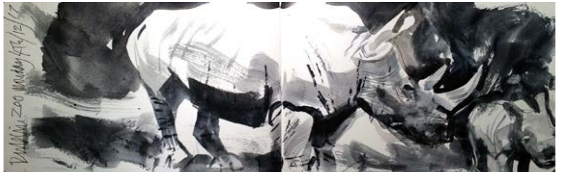
Rhinos, Dublin Zoo, watercolour from sketchbook, 13 x 41 cm