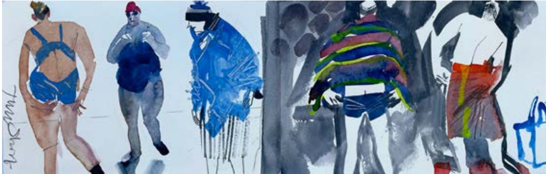
Blue Dryrobe, watercolour & inks from sketchbook, 13 x 41 cm