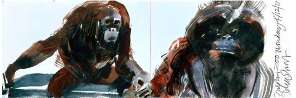
Apes, Dublin Zoo, watercolour & inks from sketchbook, 13 x 41 cm