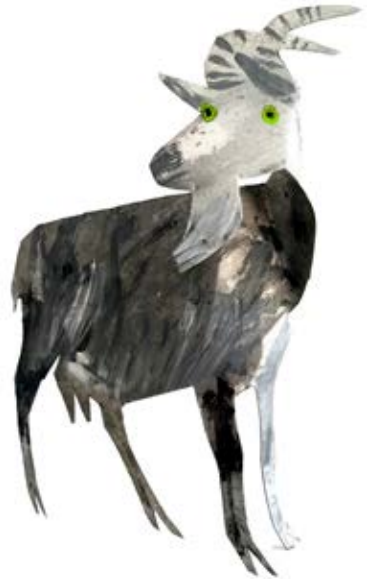
(from left to right) Billy Goat 1 Billy Goat 2 Nanny Goat oil on zinc / copper / aluminium 25 cm high (each)