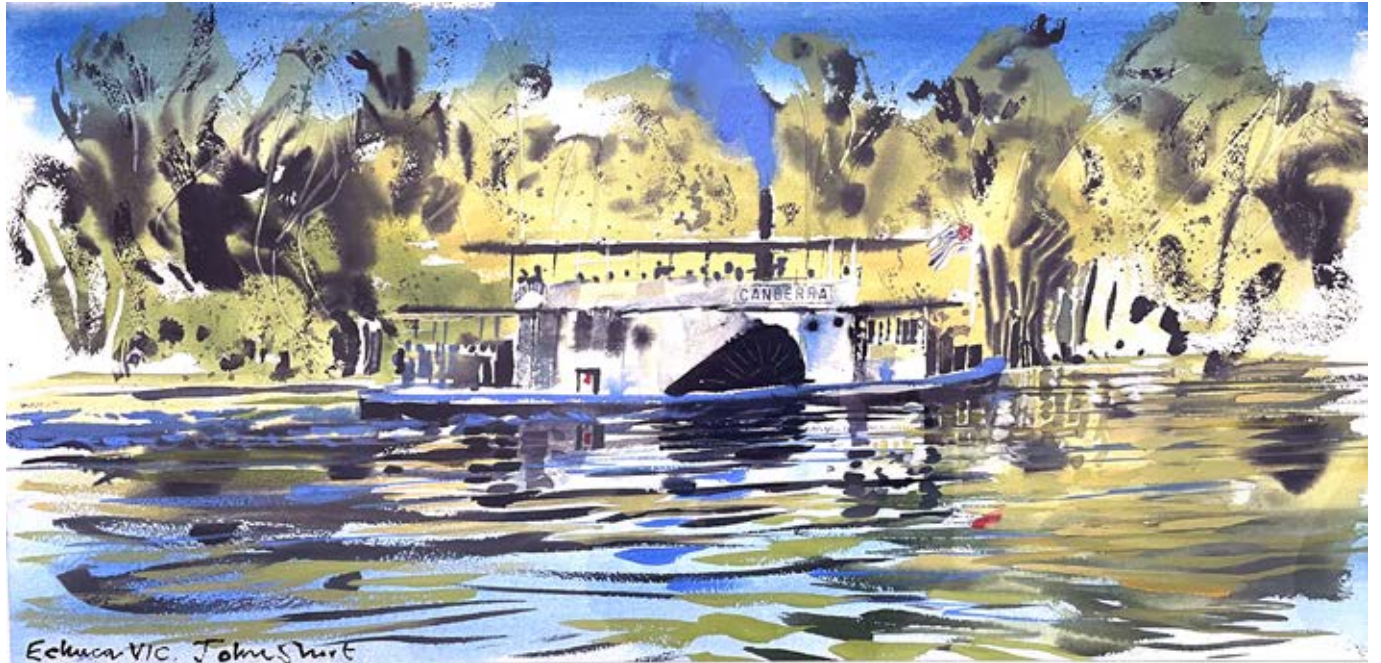
Paddle Steamer, Echuca, VIC, Australia watercolour & inks on paper 63 x 51 cm