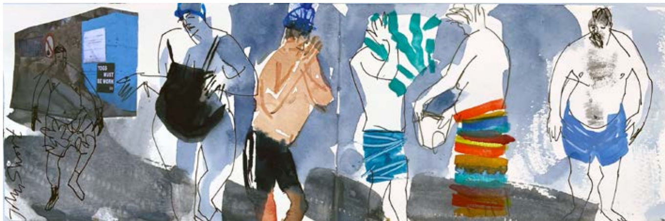
Togs Must Be Worn watercolour, collage & inks from sketchbook 13 x 41 cm