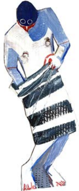
(from left to right) Farmer's Tan Guy Woman in Floral Costume Man Changing in Towel painted cardboard & wire (various sizes)