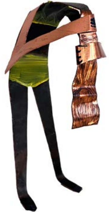
(from left to right) Man Putting on Bootee Woman with Green Hat Girl Drying Her Long Hair oil on copper (various sizes)