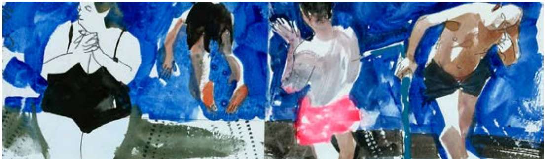
Diving Guy , watercolour & inks from sketchbook, 13 x 41 cm