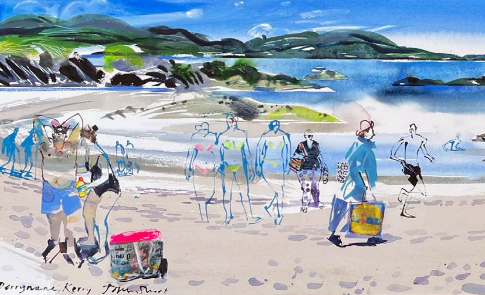
Derrynane Beach, Co. Kerry, watercolour & inks on paper, 46 x 152 cm