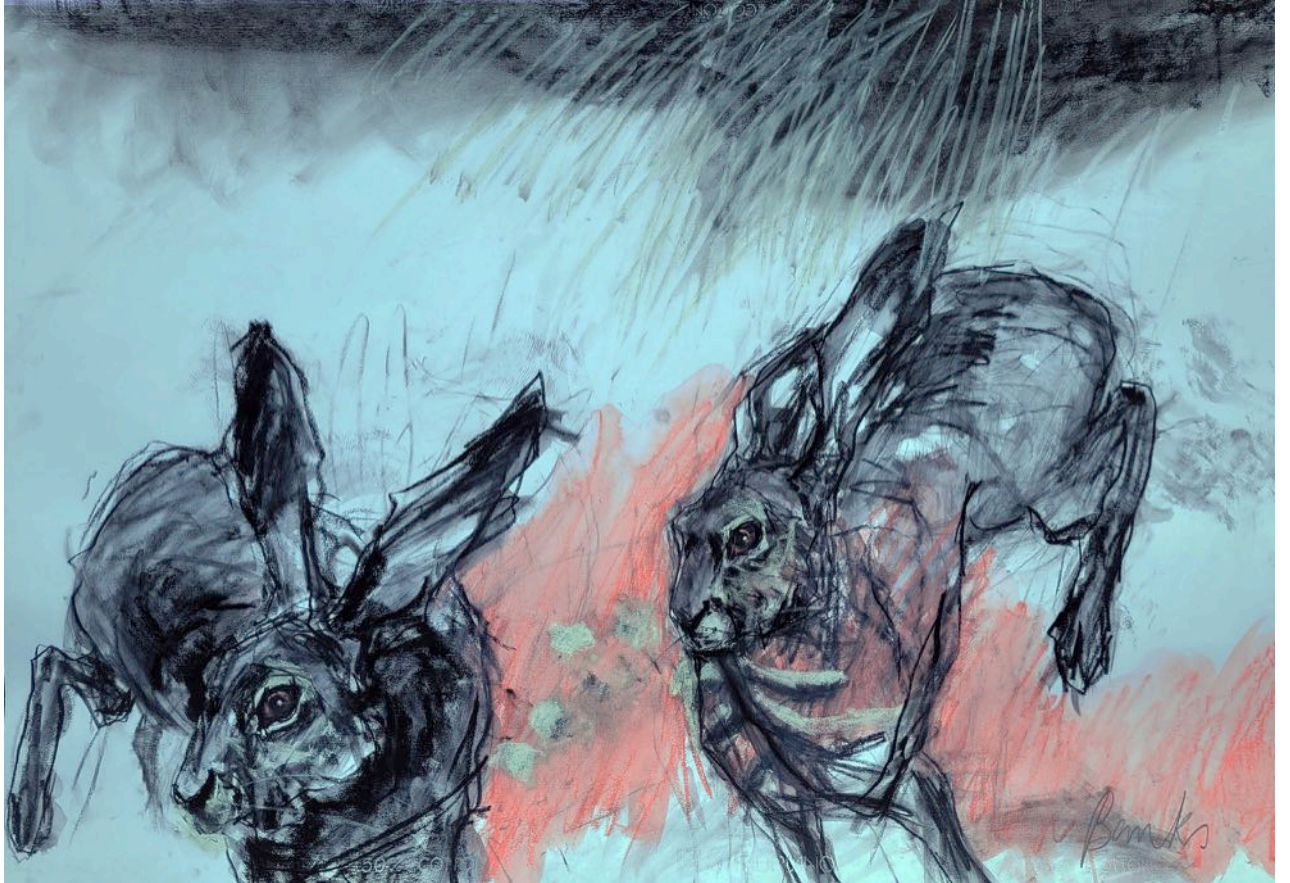
CAUGHT BY THE RAIN, mixed media on paper, 70 x 100 cm