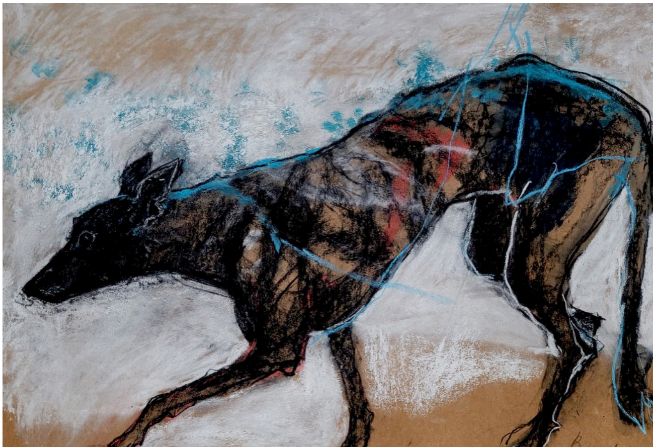
A TOUCH OF QUIET GRACE, mixed media on paper, 70 x 100 cm