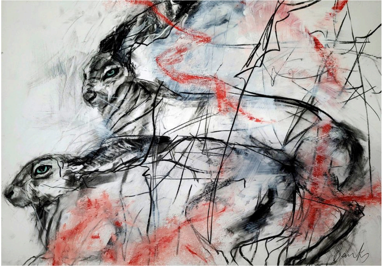
I KNOW THAT THEY HAVE SOULS, mixed media on paper, 70 x 100 cm