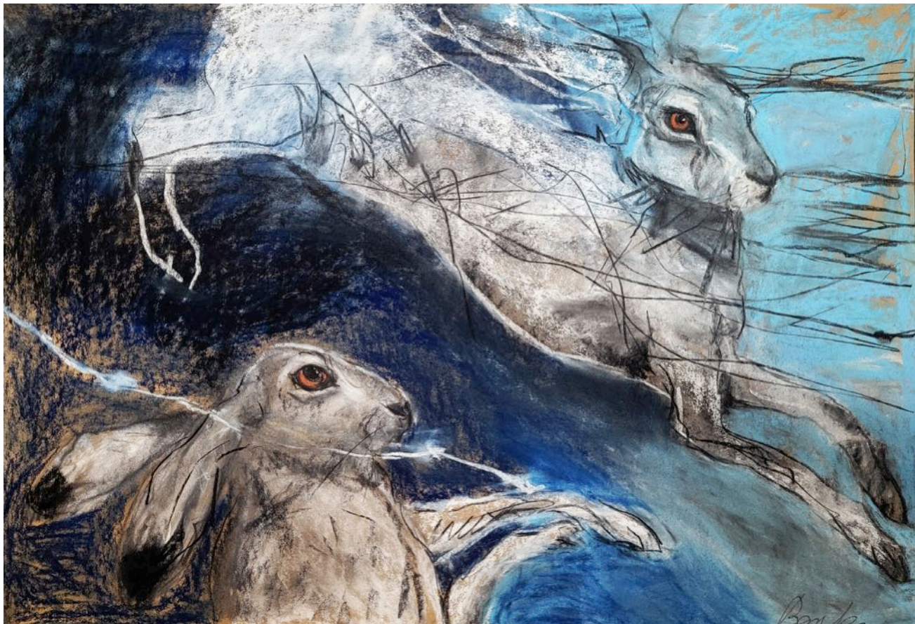
MAGIC IN THE STARS, mixed media on paper, 70 x 100 cm