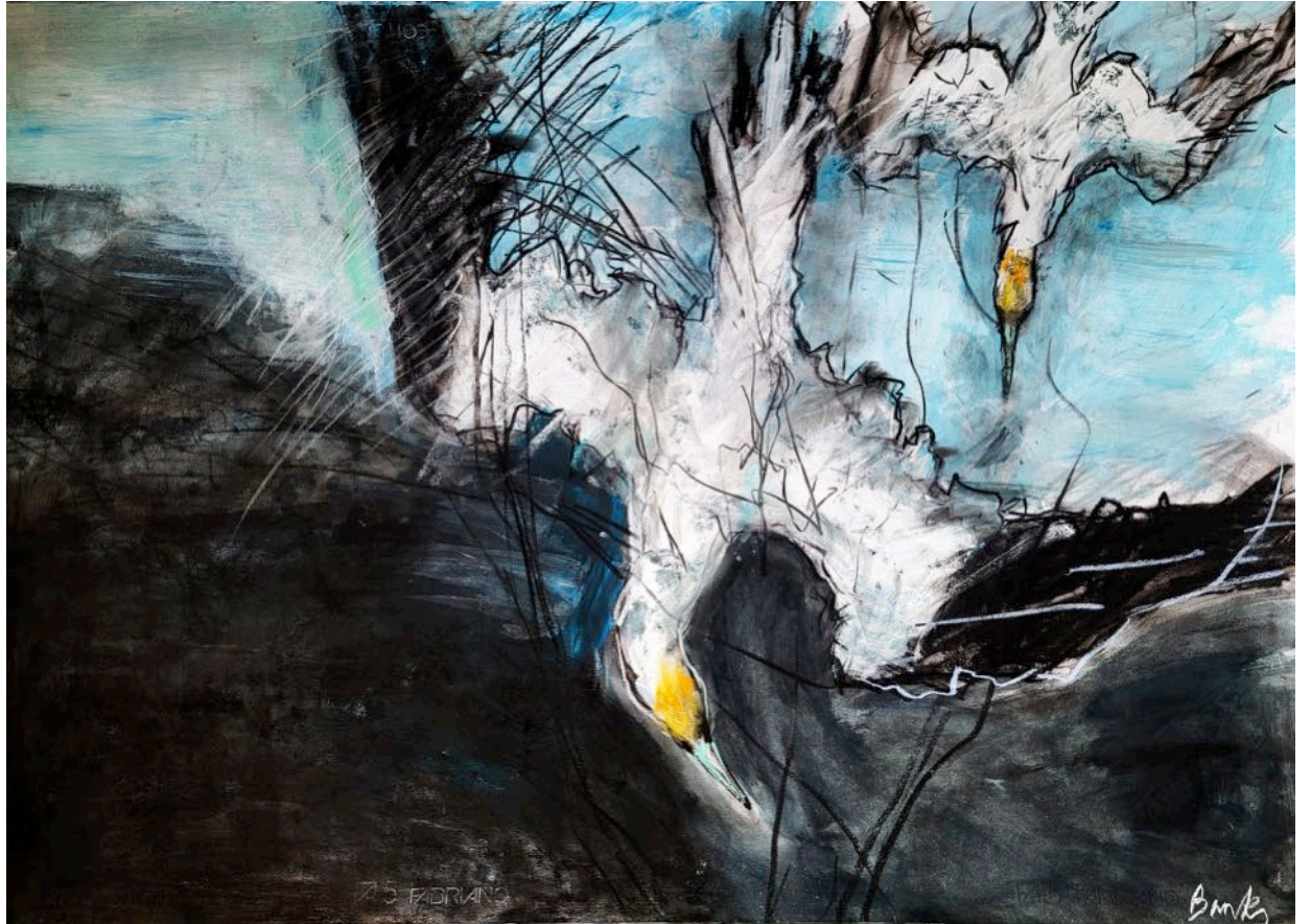
HAPPINESS ON THE WING, mixed media on paper, 70 x 100 cm