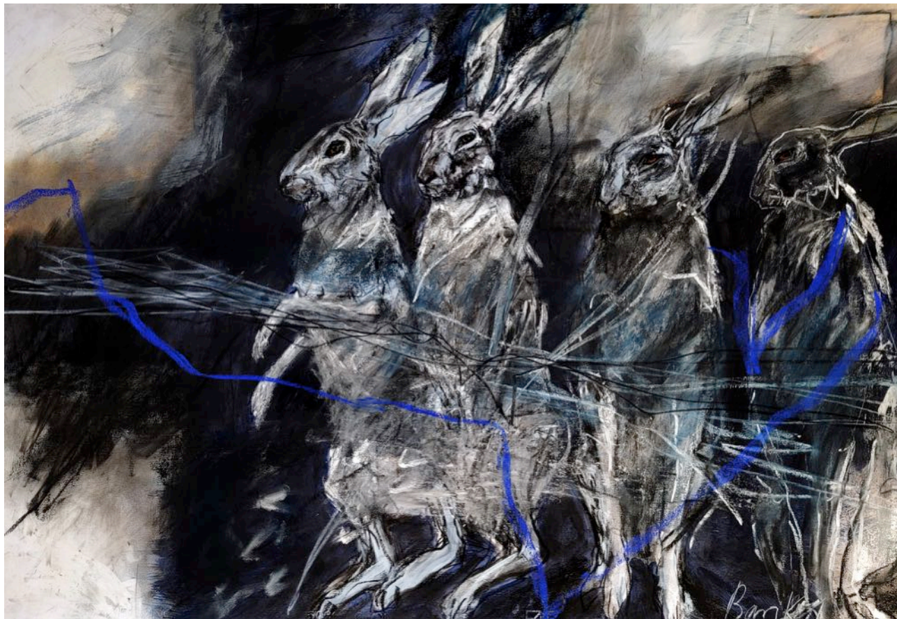
GHOSTIES, mixed media on paper, 70 x 100 cm