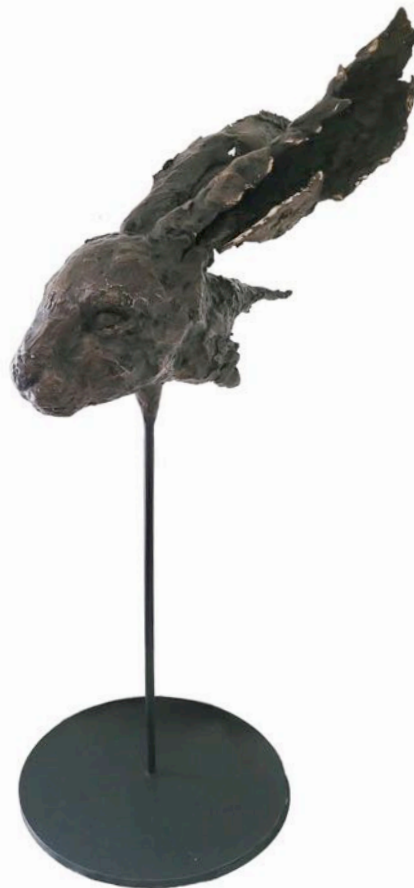
Right: THE MYSTERY OF THE HARE, bronze, edition of 5 (plus 2 AP), 78 x 48 x 30 cm