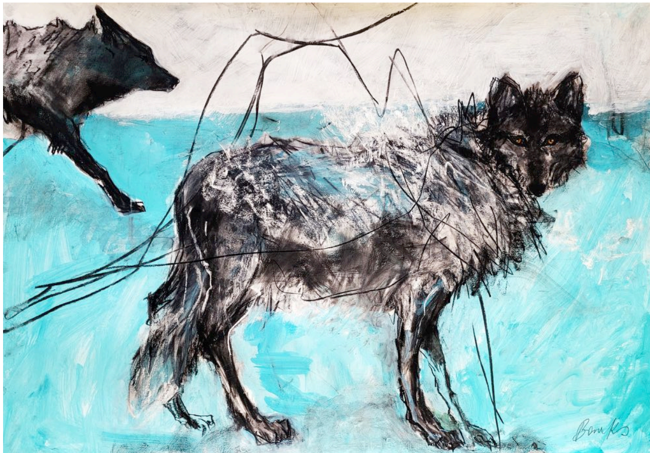
TWO WOLVES, mixed media on paper, 70 x 100 cm