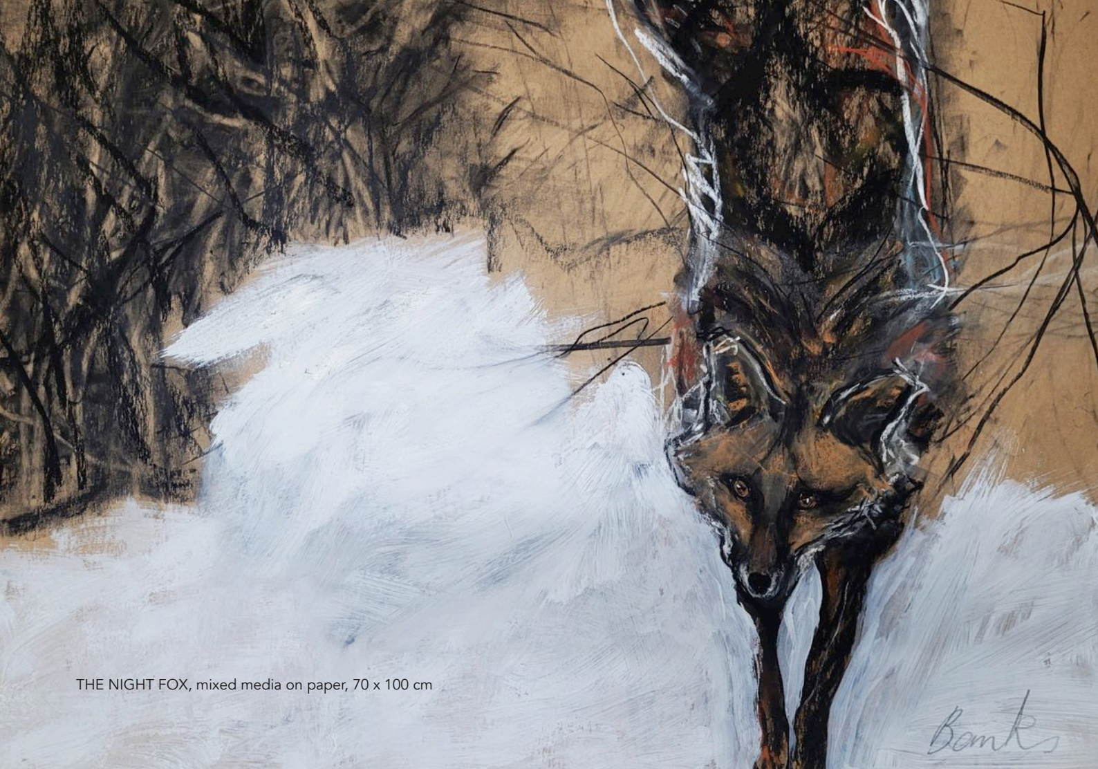
THE NIGHT FOX, mixed media on paper, 70 x 100 cm