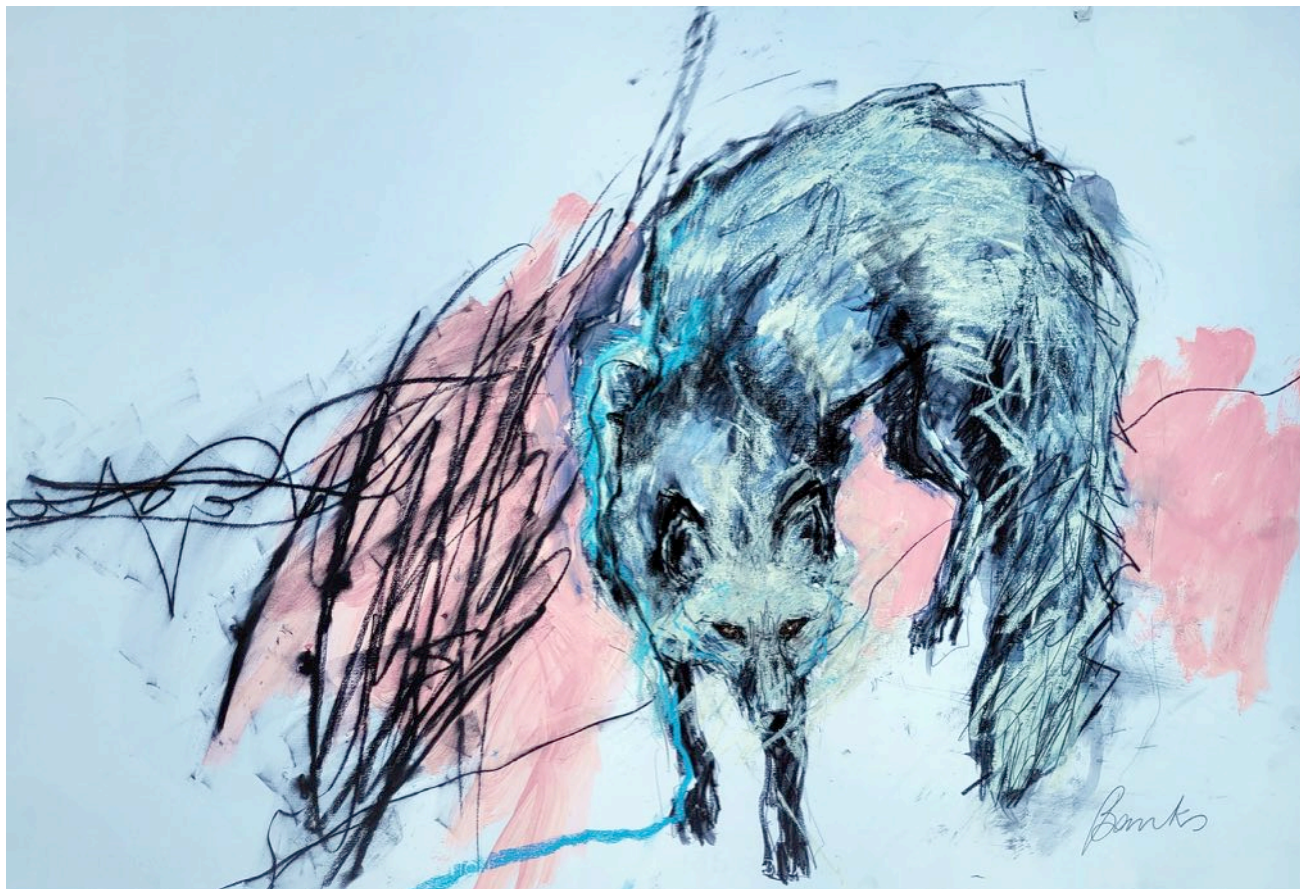
MEANDER, mixed media on paper, 70 x 100 cm