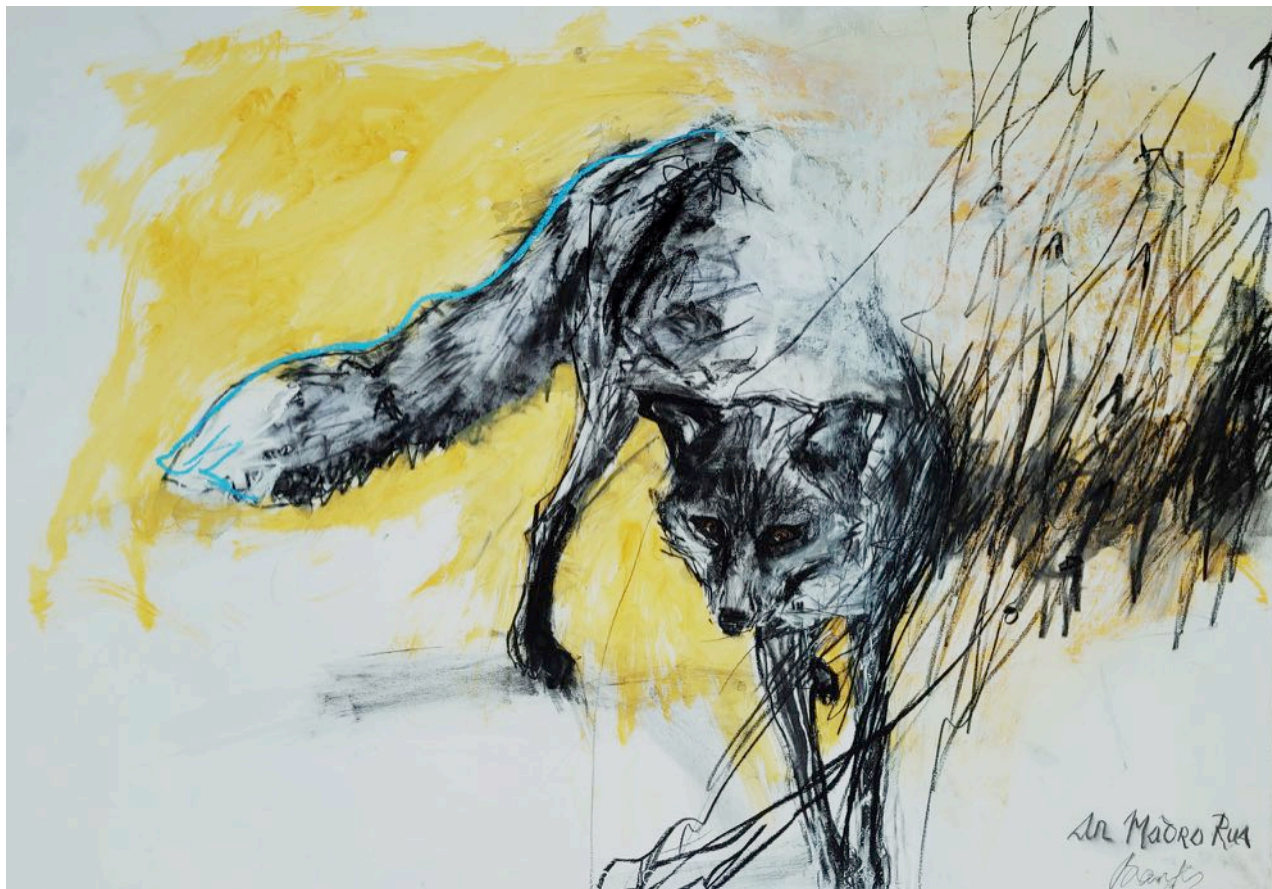
AN MADRA RUA, mixed media on paper, 70 x 100 cm