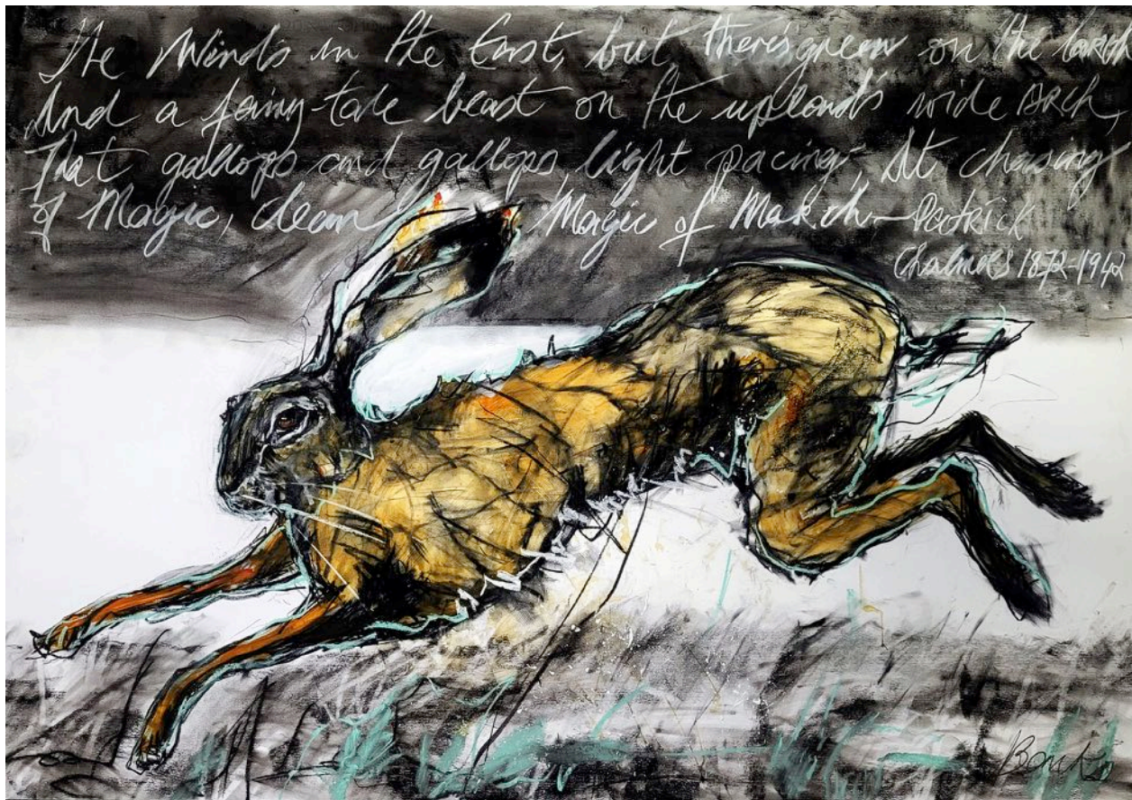
THE MAGIC OF MARCH, mixed media on paper, 70 x 100 cm